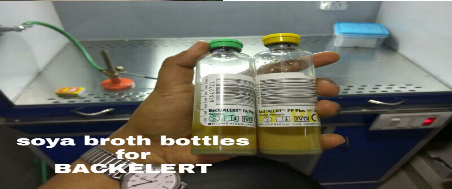
soya broth bottles for BACKELERT