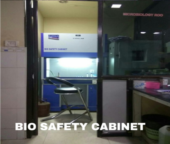
BIO SAFETY CABINET